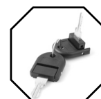
Keys x 2